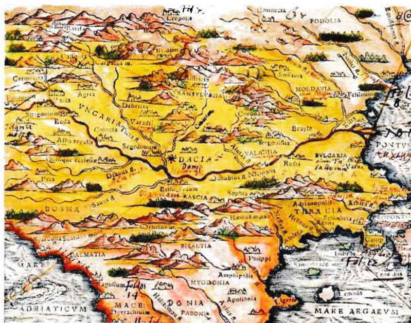
Map of the middle Danube basin by Johannes Honterus (1498-1549) - the territories of Transylvania, Wallachia and Moldavia under the name DACIA - published in „Rudimenta Cosmographiae”, Braşov, (1541) ( https://commons.wikimedia.org/wiki/File:Johann_Honterus_Septemcastrensis_de_Corona.jpg )