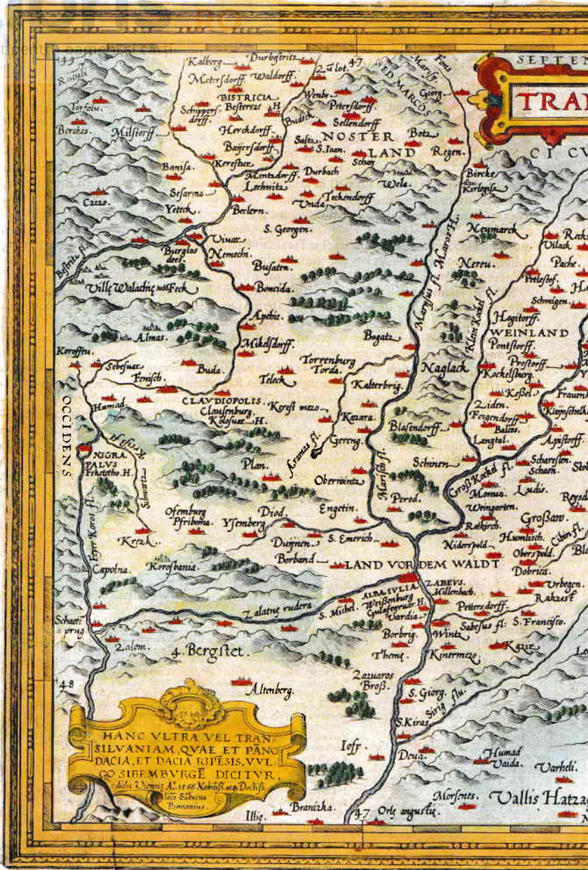
The map of Transylvania and Wallachia by Abraham Ortelius (1527–98) ( https://commons.wikimedia.org/wiki/File:Transylvania_by_Abraham_Ortelius_1612.jpg )